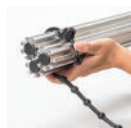
WRAP & STRETCH