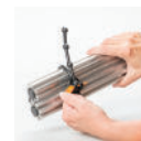
WITH LOCK PIN